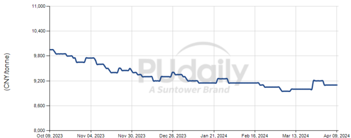
Flexible Slabstock Polyols (Bulk/DEL) Daily Prices in South China