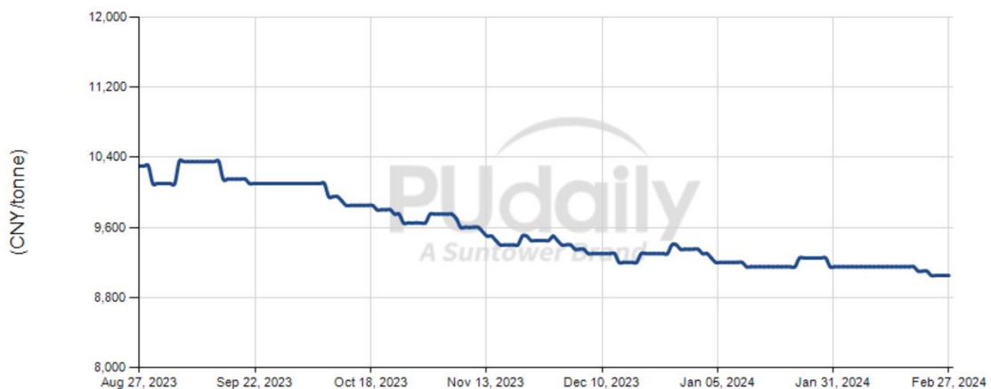
Flexible Slabstock Polyols (Bulk/DEL) Daily Prices in South China