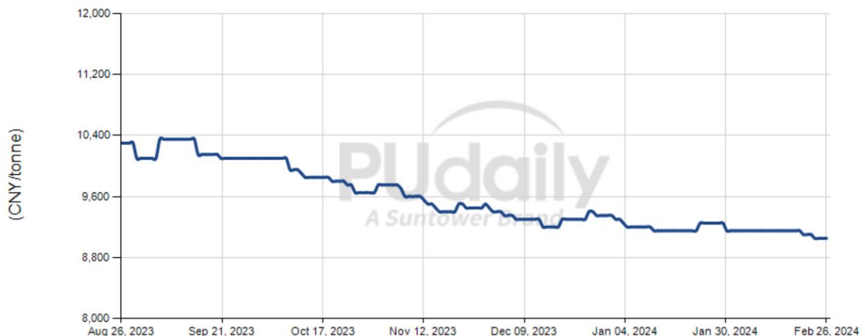
Flexible Slabstock Polyols (Bulk/DEL) Daily Prices in South China